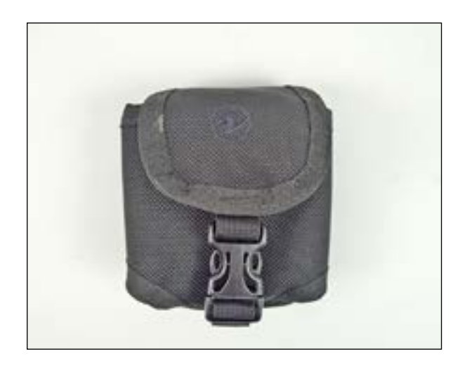
Trim Weight Pocket