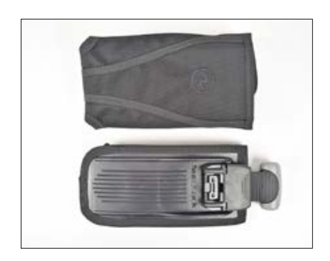
SureLock™ Weight Pocket

1. Optional SureLock<sup>™</sup> or trim weight pockets can be attached to the dual connectors on the harness. When attaching the SureLock<sup>™</sup> weight pockets ensure the release handle is pointed downward. Trim weight pockets can face either direction.